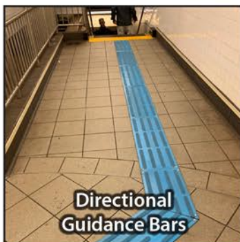
Directional Guidance Bars