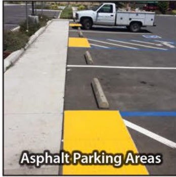
Asphalt Parking Areas