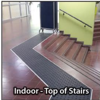
Indoor - Top of Stairs