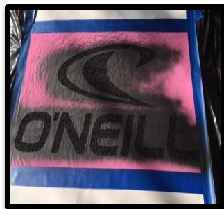
Paint & Blow-Dry